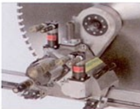
DZ-S2 depth of cut up to 510mm