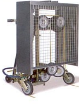
SK-SD wire length of 10.8m