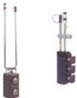
CP-110/BTH350P force of 110 and 260 tons