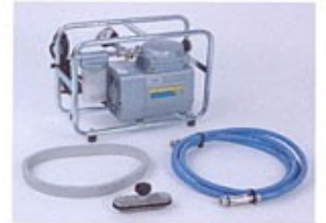
CDLP from Dia. 15mm to 42 mm