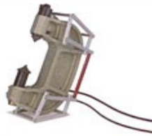
CRUSHER BZ 120 to 300mm wall thick