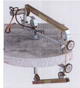
SL/SL WX circulare cuts of dia 500mm