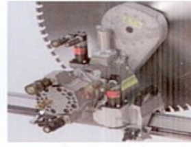
FZ-4S depth of cut up to 1005mm