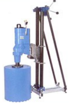
BC-2 + DME75