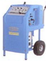
PPH25S output power 25kw remote control