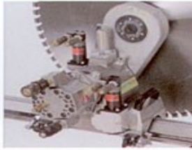
FZ-2ST BELT DRIVEN depth of cut up to 710mm