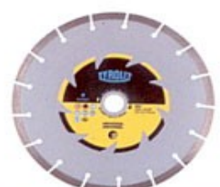
EH-T PREMIUM hard stone blade