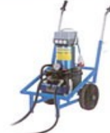
DRIVE UNIT BW-2 pressure up to 750 bar