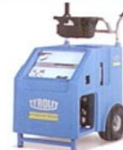
PPH25RRP output power 40kw remote control