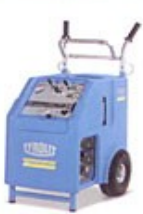
PPH20P output power 20kw remote control