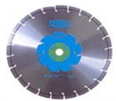
FSA PREMIUM preumim asphalt blade