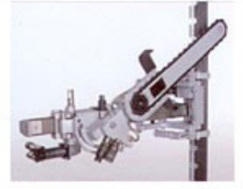
CSF-50 depth of cut up to 500mm