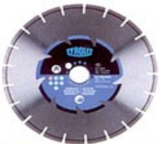
TABLE SAW BLADES