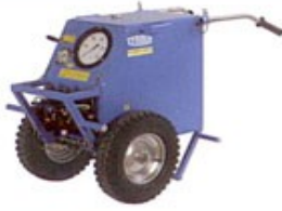
DRIVE UNIT AU pressure up to 2000 bar