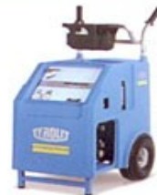
PPH20RRP output power 25kw