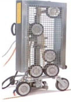
SK-B wire length of 7.5m