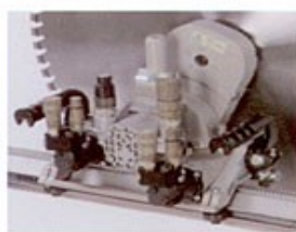
WZ GEAR DRIVEN depth of cut up to 710mm